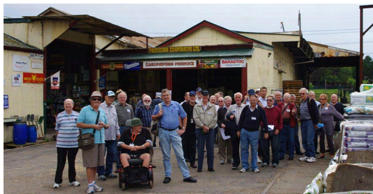
The Luncheon Club group outside the former Carlingford Goods Shed, now serving as a Produce Store. Part of one of the former sidings is in the right foreground.

Our next outing is on 18 May, and we are going to Olympic Park Station. We meet on the upper concourse area adjacent to the Booking Office at 11.00am. For the future we are going to Clyde in June, Waratah in July, Lindfield in August and in September it's our 2-day outing to Goulburn. Booking forms for this will be in the June Newsletter.