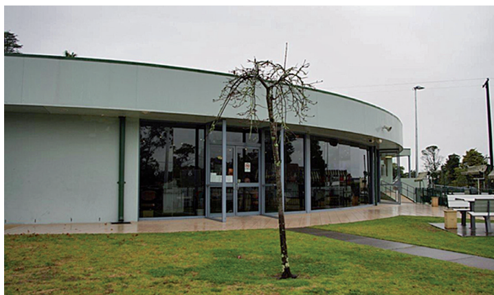
A part view of the former concrete water tank at Lawson, converted into a Bowling Club.

Lunch was had in the Lawson Bowling Club, another railway gem as their main building is located in the former