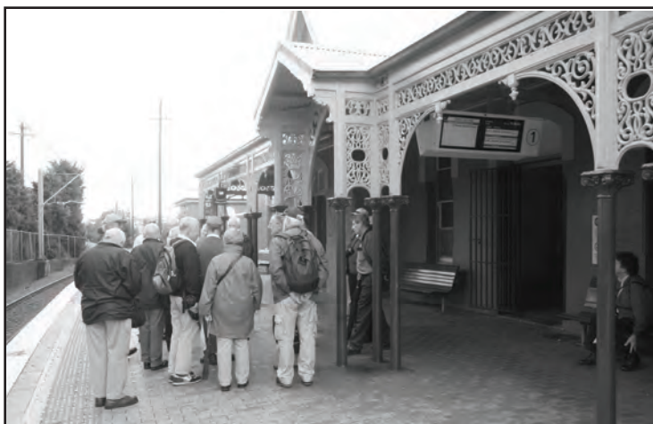
Arncliffe is a well-presented station with pleasing architecture. Here the Luncheon Club group is gathered on Platform 1.