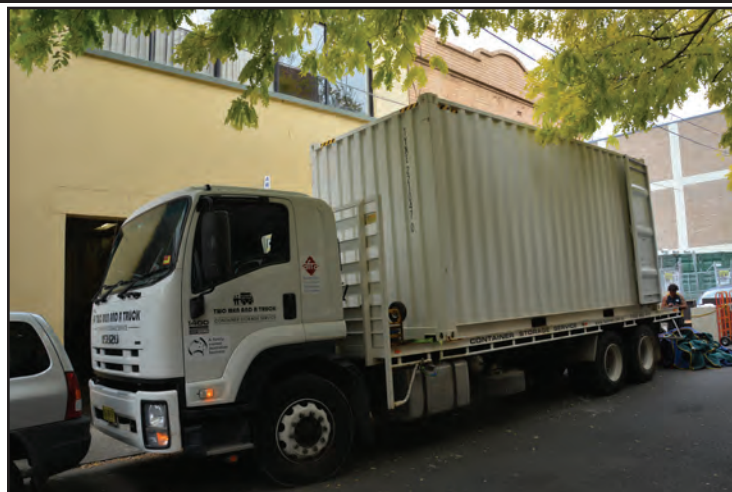
Above: It took two trucks to move the bookshop to Renwick Street Redfern, on Wednesday 26 February. This was the largest of the two.

And that's a clue to the future of the Society's premises - we are looking for new location suitable for the Society's retail and RRC operations