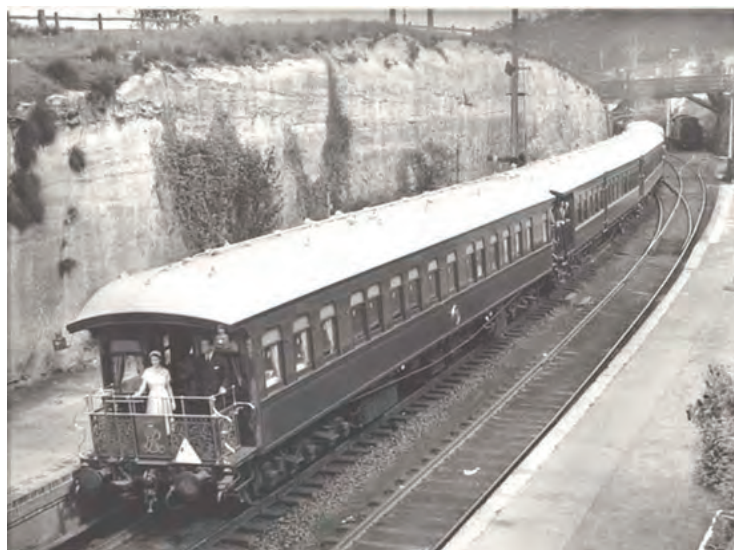
Queen Elizabeth II and Prince Phillip onboard the Royal train travelling through Mount Victoria

Retracing the journey taken by Queen Elizabeth II and the Duke of Edinburgh from Bathurst to Central Station on Friday 12 February 1954