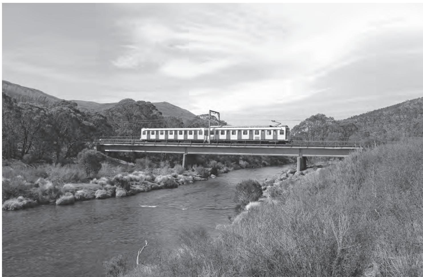
A two-car Skitube train crosses the Thredbo River not long after departure from Bullock's Flat terminal in the NSW Snowy Mountains. The train is about to begin the 1 in 8 climb to Perisher Resort, most of which will be in the Bilston Tunnel. When this photo was taken on Monday, 30 September 2013, near the end of the snow season, the service was operated by a four-car and a two-car set on a 30 minute frequency with an uphill train departing Bullock's Flat immediately a downhill train arrived.

Booking form will be available next month.