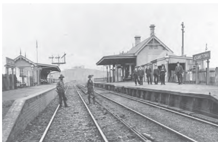
Above: Adamstown Station as captured by photographer Ralph Snowball in 1908. With the Up main signal set for clear, one hopes that the two fettlers will get clear of the line!! Ed Tonks Collection