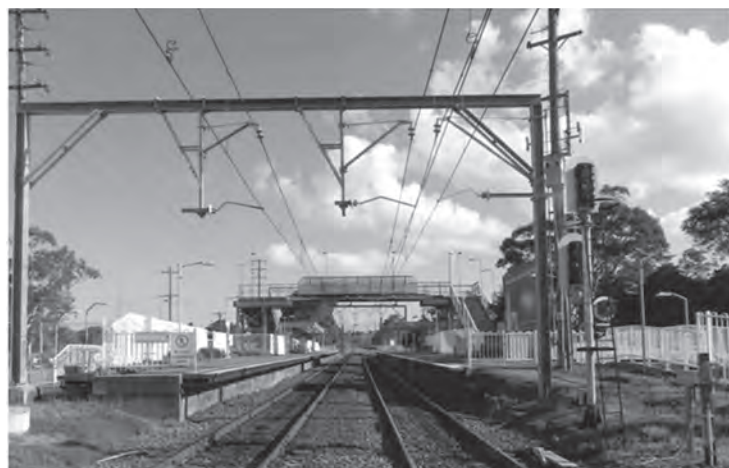
Below: A similar view of Adamstown Station, taken on 21st May 2014.