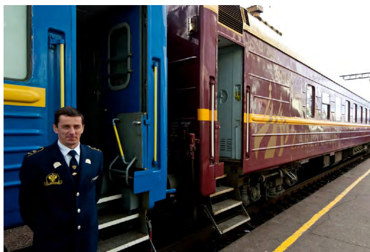
The Trans Siberian tour will travel in the Tsaran Gold Private Train for 11 days

(Contestants are to submit digital images at least 24 hours beforehand to: mail@arhsnsw.com.au Digital images cannot be submitted on the night. *Submissions are limited to FIVE slides or digital images only. The subject should also be the image's main focus. Contestants must know when and where the slide/image was taken and mark the slide accordingly otherwise image will be ineligible to win.)