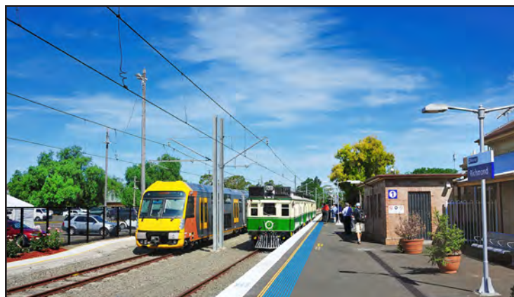
Waratah Set A45 contrasts with the Rail Motor Society's "Tin Hares", CPH 7,3 and 1, stabled in Platform 1 at Richmond on 29 November during the Richmond Line's 150th Celebrations.