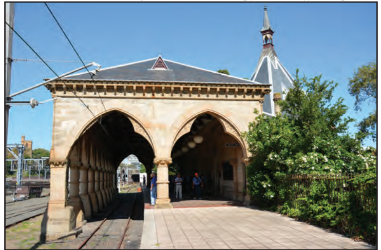
The view south. Left column has been shaved for clearance purposes.