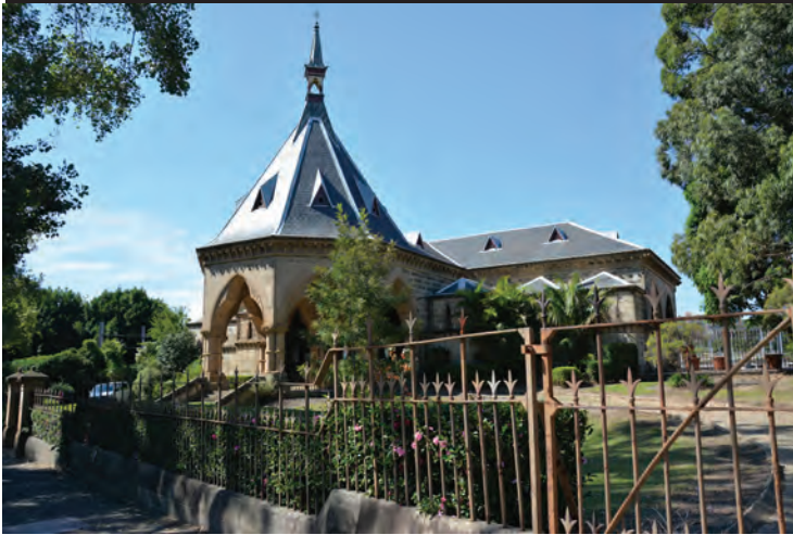
The view from Regent Street of the Mortuary Station on Wednesday 15 April 2015.