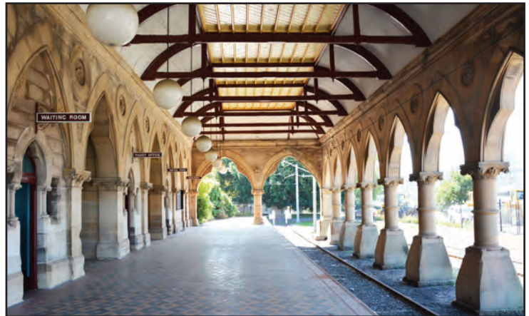
The view north through the restored canopy to the buffer stop.