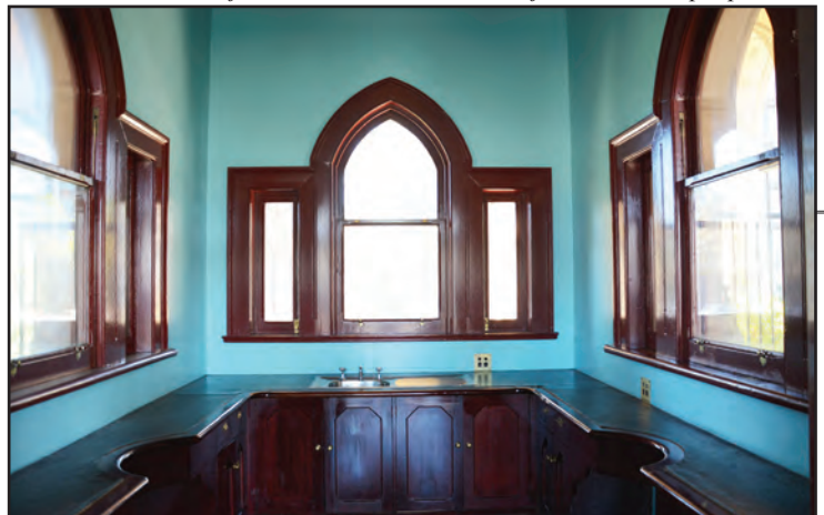
Beautifully restored double-window "ticket office"