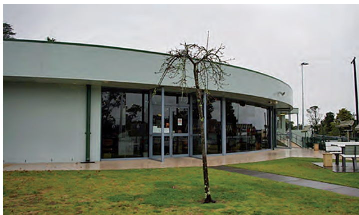
A part view of the former concrete water tank at Lawson, converted into a Bowling Club.

Lunch was had in the Lawson Bowling Club, another railway gem as their main building is located in the former