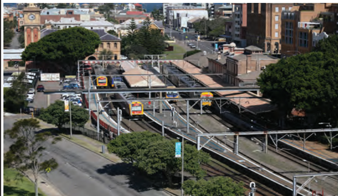
The winning image of Newcastle Station, taken by Enzo Smith, just before the closure.

The winning image may be used for publicity purposes in the Society's print and digital media.