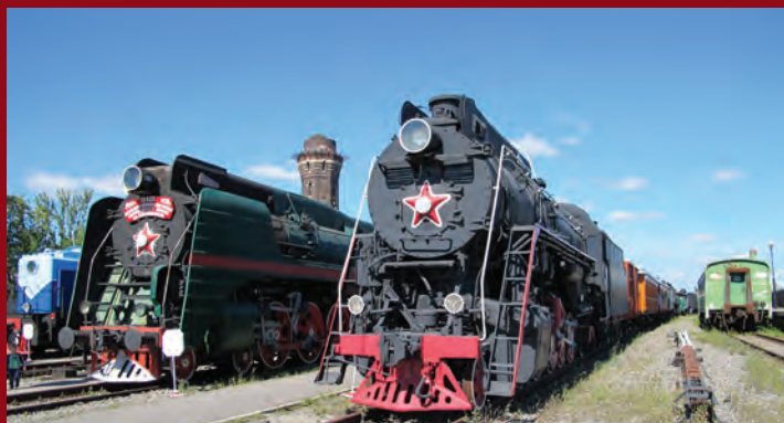
Modern Russian passenger and freight steam power at the former Warsaw Station in St Petersburg on 19 August 2015.

To commemorate the effort of NSW Railwaymen in WWI, Sydney Trains and Transport Heritage NSW have produced a special online ANZAC centenary exhibition and photographic gallery.