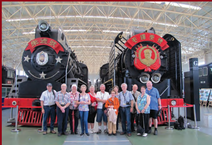
A group photo in the cavernous hall of the China Railway Museum in Beijing on 3 August 2015.

In August 2015, the first ARHSnsw tour to feature the Trans-Siberian Railway was successfully run. The awesome journey began in Beijing and finished in St Petersburg to take in the sights of two very different cities and their respective railway museums. The actual Trans-Siberian train was the privately owned Tsaren Gold which runs between Erlian on the Chinese/Mongolian border and Moscow on the Russian (1520mm) broad gauge over 12 days, a distance of 7,000 km. The ARHSnsw tour group of 12 was just a small portion of the 193 passengers on the 20-car train of various degrees of luxury carriages. The scenery was incredible, particularly in Siberia and the trip on the former main line along the shores of Lake Baikal, now a tourist only branchline was a highlight of many wonderful experiences. Of course, we noted the freight traffic on the TS - one passed us on the double track mainline just about every 10 minutes! We thank China Imperial Tours for making this tour the success it was.