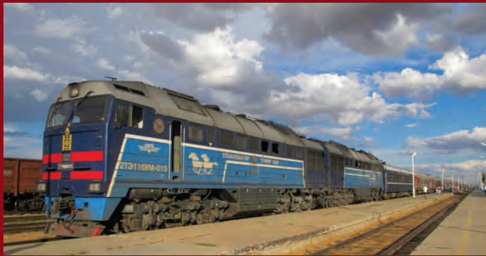
The Tsaren Gold Trans Siberian stands ready to depart Erlian Station on the Chinese/Mongolian border on 5 August 2015.