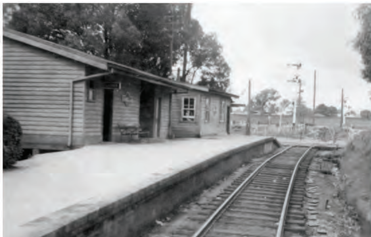
This image, as printed in John Oakes' Camellia notes, is unfortunately undated, but is certainly pre the 1959 electrification of the Carlingford line. The Grand Avenue level crossing was replaced by an overbridge in the 1980s. The tramway crossing of the railway on the level was immediately beyond the level crossing. ARHSRRC 100681