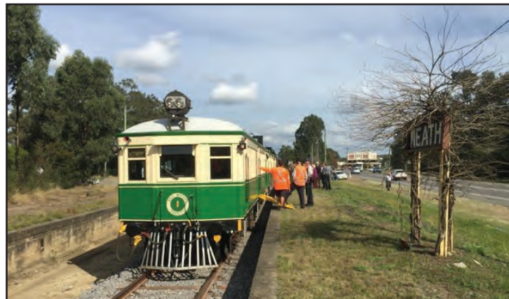
The CPHs await passengers at Neath Station.