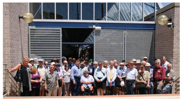
Our large group poses for the camera outside the college.

Petersham Training College is that RailCorp facility just west of Petersham Station, and whilst some of us may have been in there for Model Railway Conventions over the years, few have seen what goes on in there in the College's important role as a provider of training for RailCorp. So with this in mind, 45 members and friends attended the Railway Luncheon Club's December outing to find out.