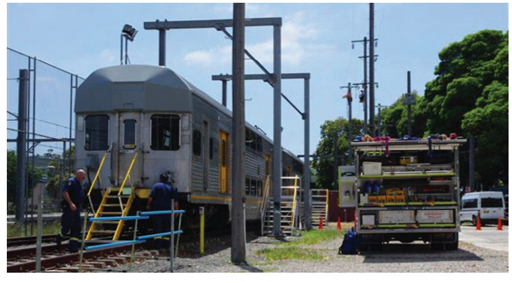
Part of the outdoor facilities of the Petersham Training College. The two suburban cars are used for a variety of training purposes, and are here being jacked up by emergency crews as part of a training exercise.