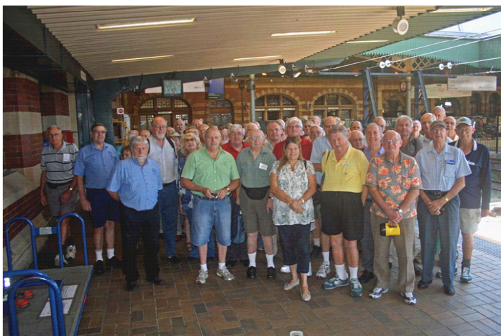
The Luncheon Club group on Platform 1 at Central ready to start the tour under this busy station.