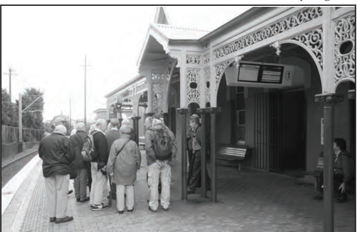
Arncilffe is a well-presented station with pleasing architecture. Here the Luncheon Club group is gathered on Platform 1.