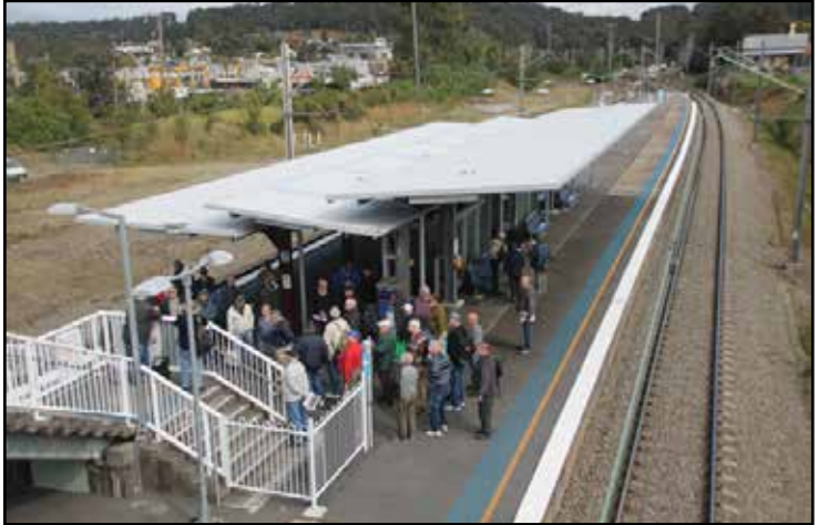
Our group at Teralba listens to Ed Tonks (on the landing and partly obscured by the overhead light) relates the history of the area. The 1982 Down platform is evident on the right as is the Station Master's residence at the right rear. The platform buildings in view were erected in 2010.