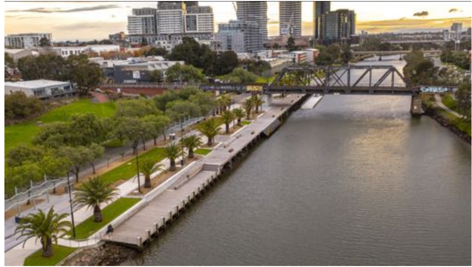
Footscray Wharf upgrade and Rail Tracks & Bridge to Bunbury Tunnel bigbuild.vic.gov.au/projects/west-gate-tunnel-project