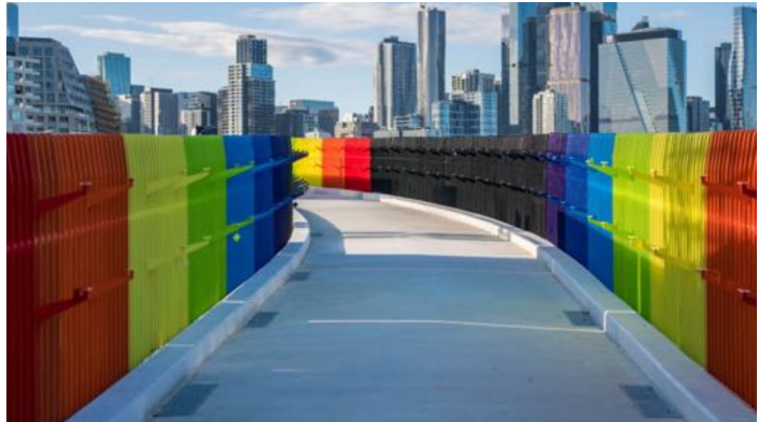
Dynon Road shared cycling and pedestrian path bigbuild.vic.gov.au/projects/west-gate-tunnel-project