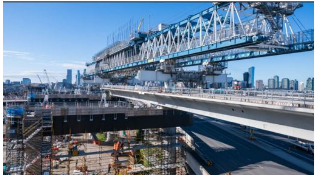
Launching Gantry constructing the elevated road over Footscray Road bigbuild.vic.gov.au/projects/west-gate-tunnel-project