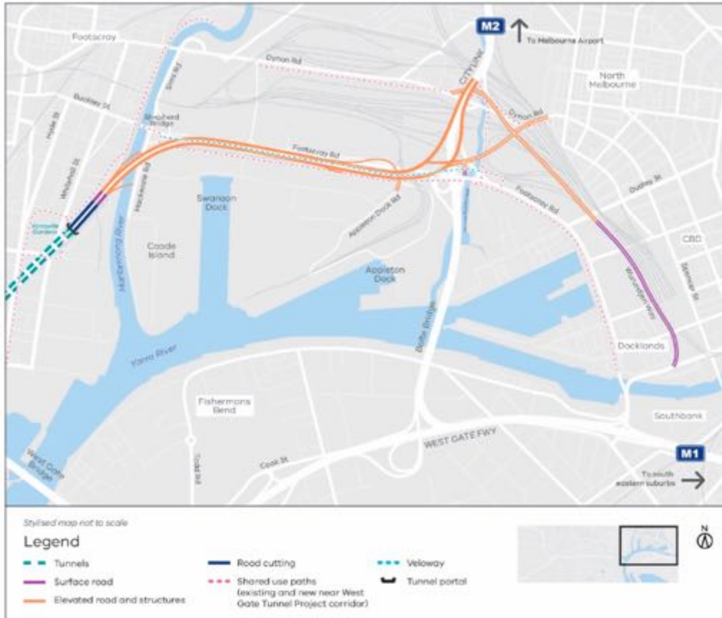
West Gate Tunnel Project showing roads out to M2 City Link & Wurrundjerri Way bigbuild.vic.gov.au/projects/west-gate-tunnel-project