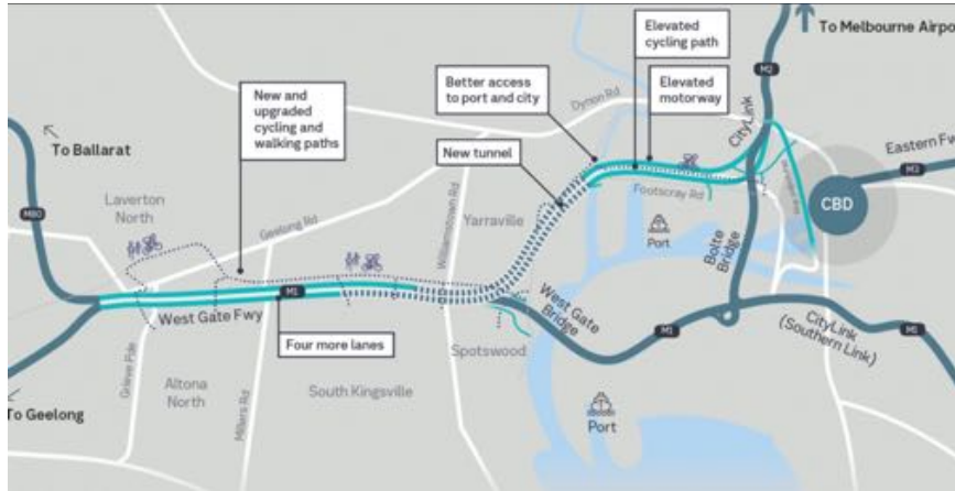
Map of West Gate Tunnel Project bigbuild.vic.gov.au/projects/west-gate-tunnel-project