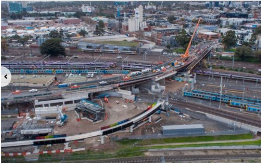
Dynon Road and Rail Tracks bigbuild.vic.gov.au/projects/west-gate-tunnel-project