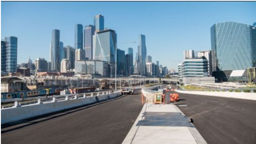
Asphalting the new Wurunderi Way Extension. bigbuild.vic.gov.au/projects/west-gate-tunnel-project