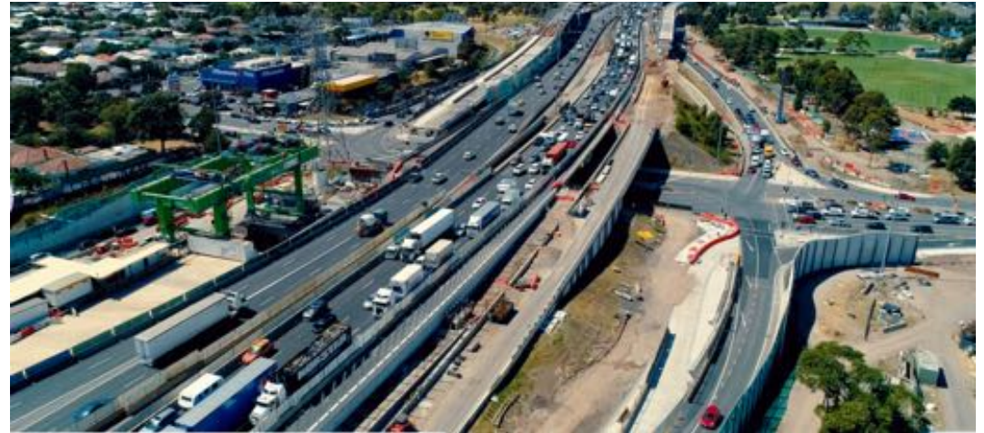
Aerial View of Widening West Gate Freeway over Willimastown Road bigbuild.vic.gov.au/projects/west-gate-tunnel-project